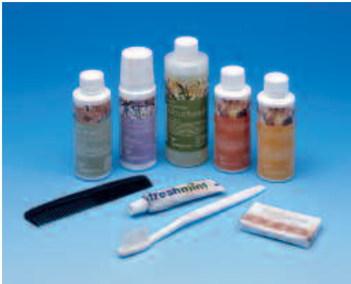
Deluxe amenities kit GS90AMN2B