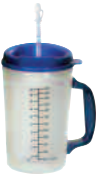
22-oz. carafe with drink-through lid (Style #520)

These tapered tumblers fit most cup holders and are a great way to leave a favorable impression with your patients. Dual flip-top closure lid with ice guard and straw. 48 tumblers per case.