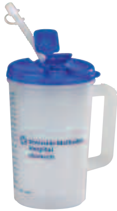
34-oz. size shown in clear polypropylene (Style #634)