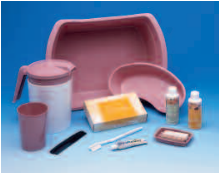
Deluxe admissions kit GS90ADM3A