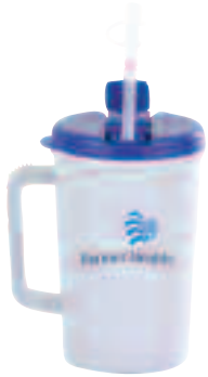
22-oz. size shown in granite-colored polypropylene (Style #622)

Please note: there are no Cardinal Health catalog numbers for these items. Please use the order form to place an order for these products.