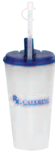
32-oz. flare tumbler (Style #2365L)