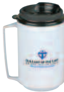
12-oz. classic insulated mug (Style #512)