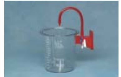
Canister with Built-In On/Off Valve 65652-511 1000cc 65652-516 1500cc 65652-531 3000cc