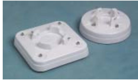
Single-Canister Roll Stand