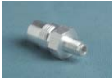
Male D.I.S.S. (Metal)

Used to support a regulator on a ring bracket or roll stand or to suspend a regulator ring bracket from a regulator. 1/8" national pipe thread plastic adapter. 1 each.