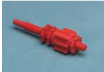
Universal Female D.I.S.S.

Allow use with standard vacuum regulator Diameter Index Safety System (D.I.S.S.) connections.