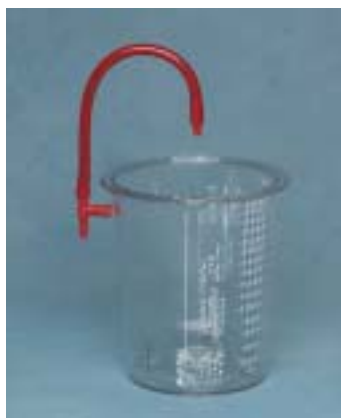
Canister with Tee Connection