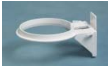
Close-to-Wall CRD Ring Bracket

Brackets slide into a wall plate or roll stand.