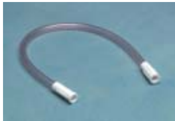
CRD™ and Guardian™ Tandem Tube

Used to connect vacuum source to canisters and manifolds. 8mm I.D. 100' roll per box; 4 boxes per case.