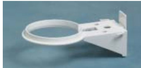
CRD Ring Bracket Extended for Regulator