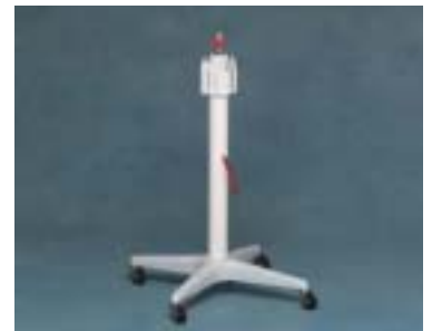
Roll Stand, Tall with Regulator Mount 65652-596