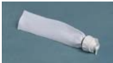
Female Specimen Sock

Used to convert pour/accessory port into a male port specimen retainer. Accepts \frac{3}{8} " to \frac{1}{2} " I.D. tubing with male port. Length 9".