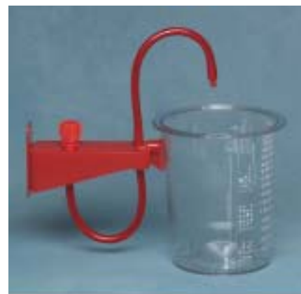
Canister with Extended Bracket for Regulator