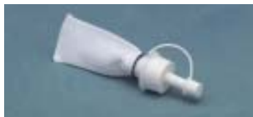
Short Specimen Sock Without Stick

Used to convert pour/accessory port into a male port specimen retainer. Accepts up to \frac{3}{8} " I.D. tubing with male port. Length 4 \frac{1}{2} ".