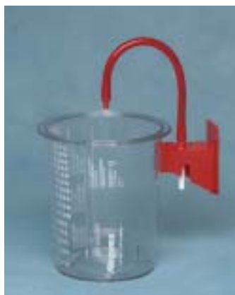
Canister for Wall Mount