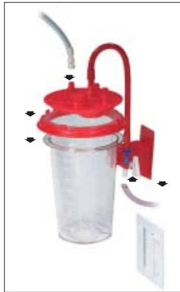
Wall-Mount Single-Canister Assembly