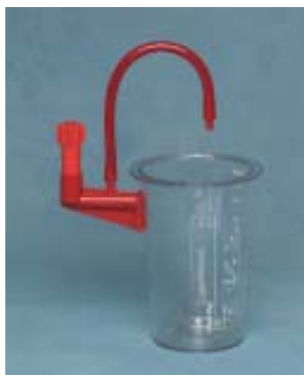
Canister with D.I.S.S.