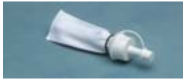
Short Specimen Sock

Used to convert pour/accessory port into a male port specimen retainer. Accepts up to \frac{3}{8} " I.D. tubing with male port. Length 9".