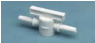
In-Line Vacuum On/Off Valve

Used to turn vacuum supply on and off as well as regulate the flow of the vacuum supply to the canister.