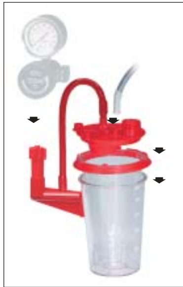
Direct to Regulator Assembly

The CRD™ system is available in several assembly options, allowing for flexibility at the point of use.