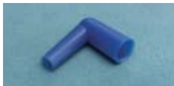
Right-Angle Adapter for Flex Advantage Port and CRD and Guardian Ortho Ports

Used to connect patient tubing to CRD and Guardian patient ports at a 90° angle. 50 per case.