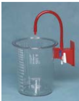
Canister with Built-In On/Off Valve

Reusable clear plastic canisters used to hold the disposable semirigid liners.