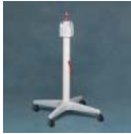
Tall with Regulator Mount