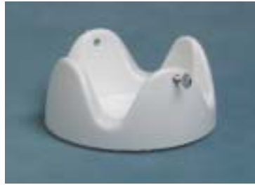
Single-Canister Base Stand