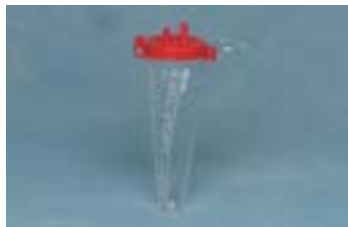
Universal Critical Measure