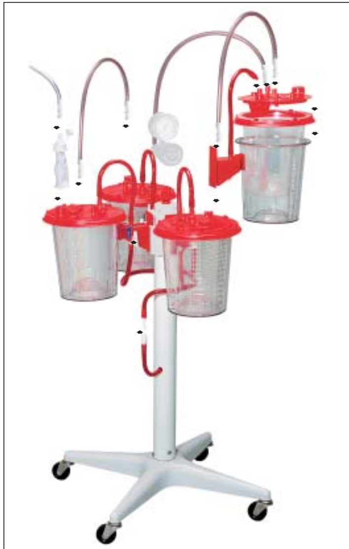
Multiple CRD Canister Tandem Assembly

This is a four-canister tandem setup to be used when fluid collection of as much as 12,000cc is anticipated. Other configurations are available to meet your specific suctioning requirements.