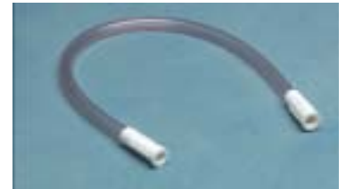
Tandem Tube 65652-542A