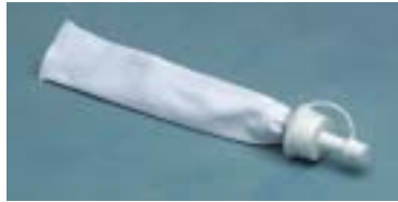
Standard Specimen Sock

Used to collect and retain specimens for analysis. 10 per case.