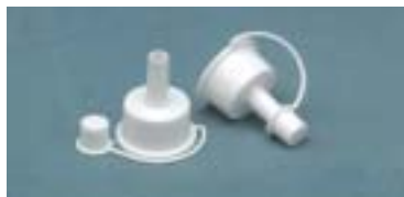
Pour/Accessory Port Converter

Used to convert the pour/accessory port into a female port specimen retainer which will accept tubing sets with preattached hard plastic (or metal) male end fittings. Length 9".