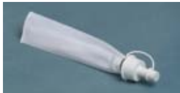
Large-Port Specimen Sock

Used to convert pour/accessory port into a male port specimen retainer. Accepts up to \frac{3}{8} " I.D. tubing with male port. Length 4 \frac{1}{2} ".