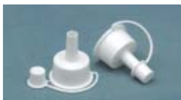
Accessory Port Converter/Large

Used to convert the pour/accessory port into an additional patient port. Accepts up to \frac{3}{8} " I.D. tubing with male port.