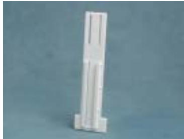
Variable Height Adapter

Used to attach ring brackets to a vertical surface. Predrilled with four 1/4" holes. 1 each.