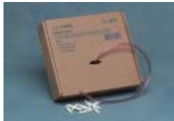
Bulk Connecting Tubing

Flexible, connecting tubing to adapt system for various setups.