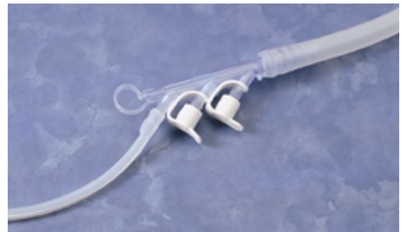
The multiport connector allows connection for up to three wound drains.