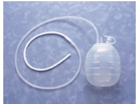
Hemaduct cardiothoracic drain attaches directly to Jackson-Pratt 400cc bulb reservoir.

Hemaduct, Jackson-Pratt and Medi-Vac are registered trademarks of Cardinal Health, Inc. or one of its subsidiaries. Blake is a registered trademark of Johnson & Johnson.