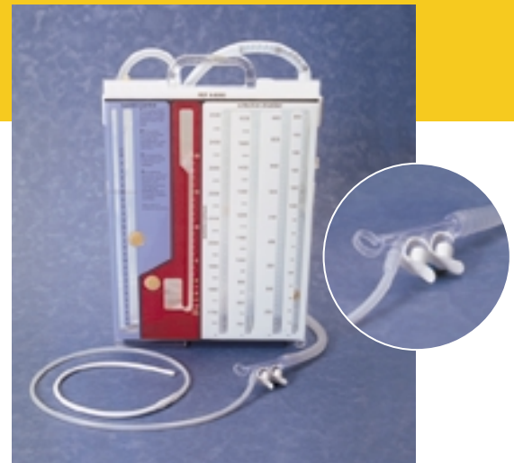
Multiport connector attaches directly to any chest drain unit.

For more information or to place an order, please contact your Cardinal Health, Medical Products and Services sales representative or call customer service at 1.800.964.5227.