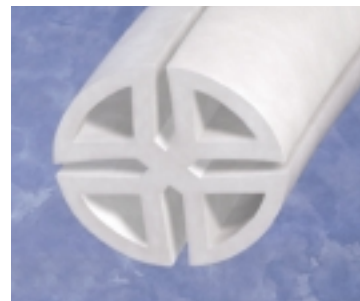
Unique system of channels, lumens and portals provides suction throughout entire drain.