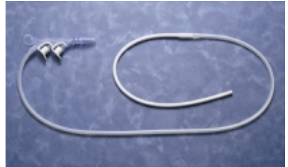
Hemaduct cardiothoracic drain and multiport connector.