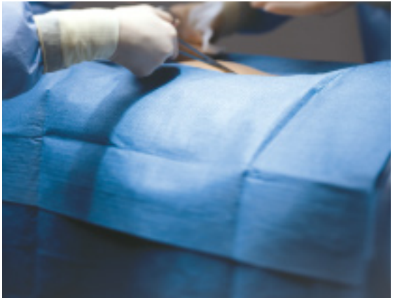
Tiburon® surgical drapes

For the most demanding procedures, this breathable impervious surgical gown sets new standards for comfortable, cool and impervious protection against both fluid and microorganisms. With SmartGown™ surgical gowns, you no longer have to choose between comfort and protection – you get all the benefits of an impervious gown without sacrificing the lightweight, breathable comfort you prefer.