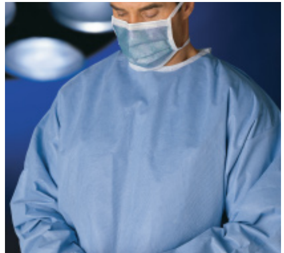
Astound® surgical gowns